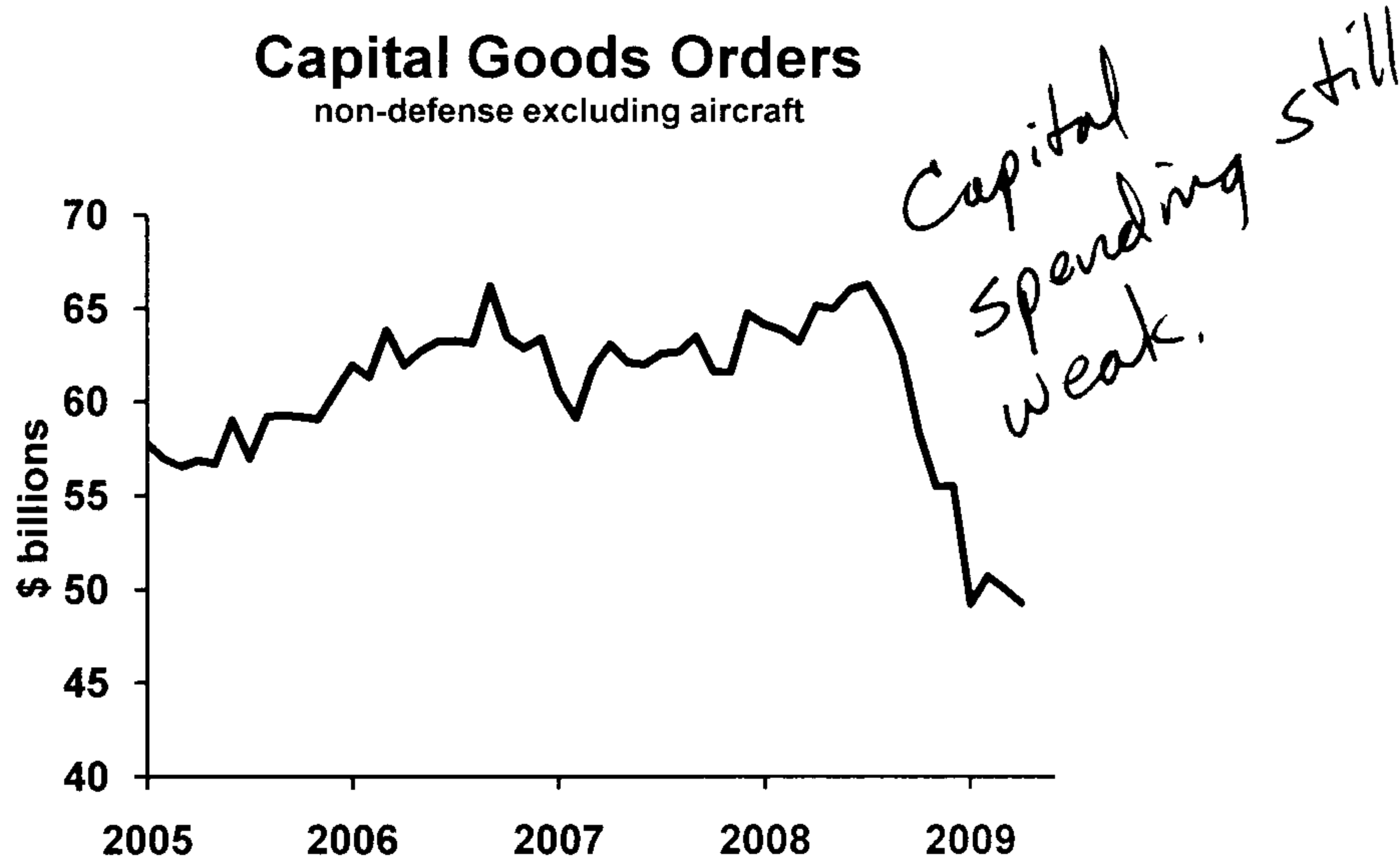
Capital Goods Orders non-defense excluding aircraft